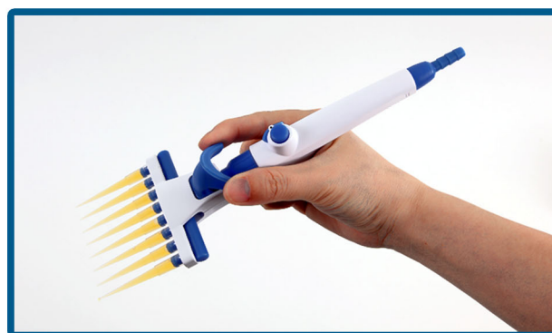
Shown with 8 Channel Pipette Tip Adapter (V0020-8)